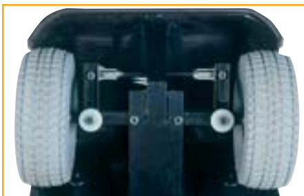
Independent front suspension