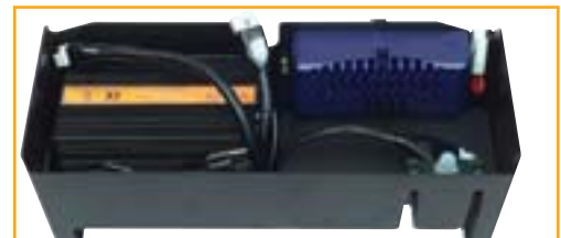
On-board self-diagnostics system