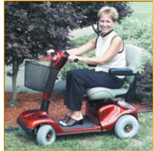
Attractive and comfortable