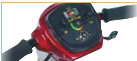
Easy to operate