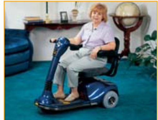
Attractive and affordable