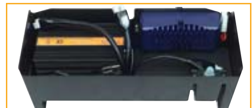
On-board self-diagnostics system