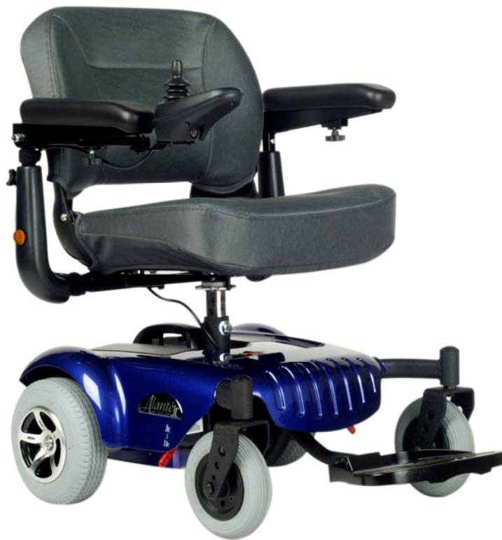
Alante Jr. GP200