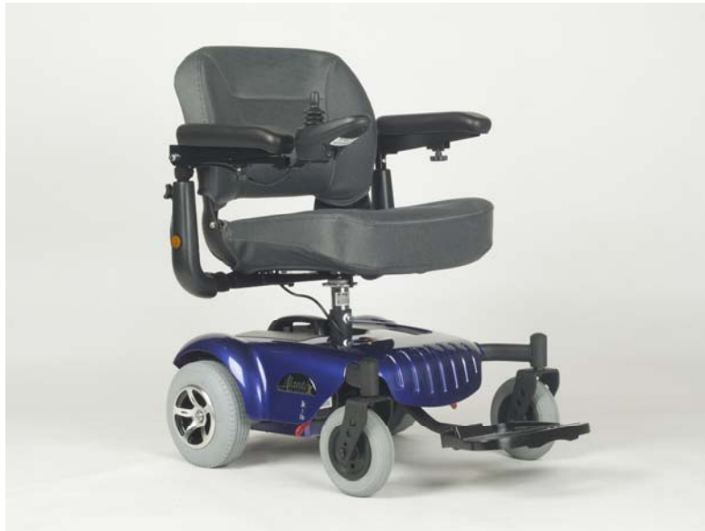
Alante Jr. GP200 – (Arctic Blue Body Color)

Please read and thoroughly understand “Safety Rules” and “Driving On An Incline” sections of this manual.