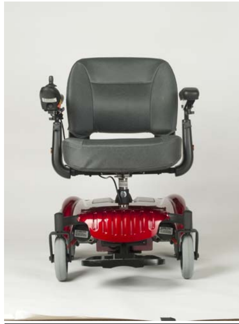
Alante Jr. GP200 (Candy Apple Red Body Color)