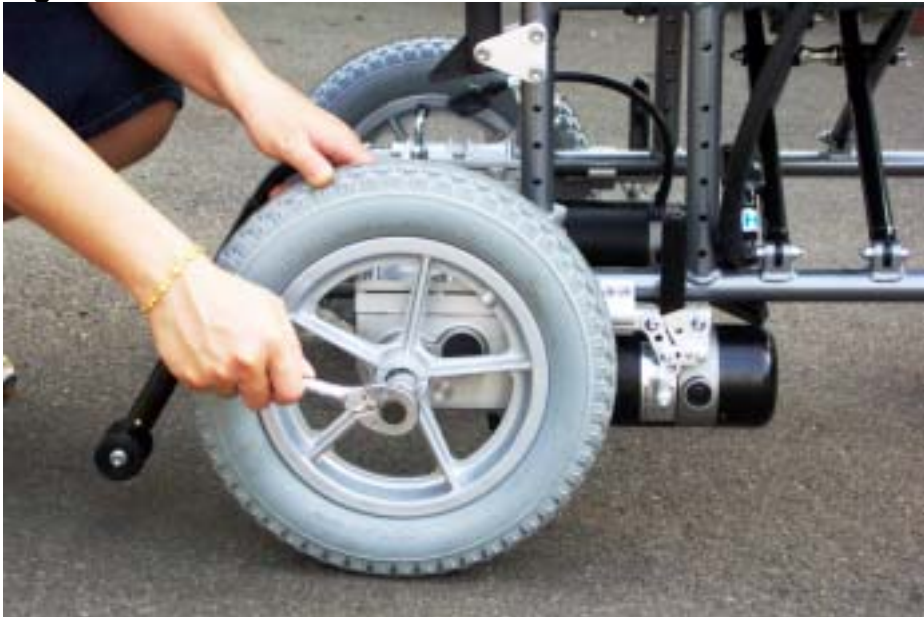
Fig 41 Rear drive wheel Screw removal

Rear wheel fixing screw must be tightened by 1000 KGF.CM torsion.