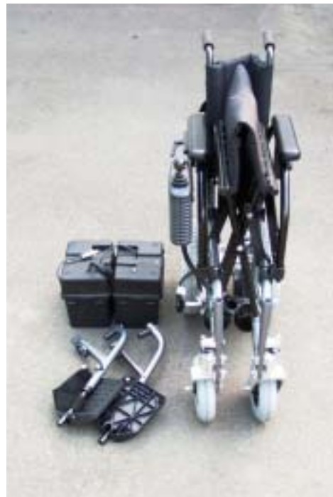
Foldable Frame, various quick release construction