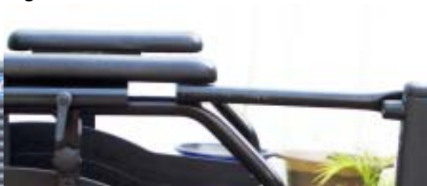
Adjustable forward and backward