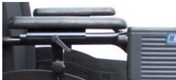
with DL controller