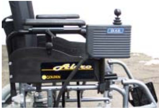
Height adjustable armrest w/DL controller