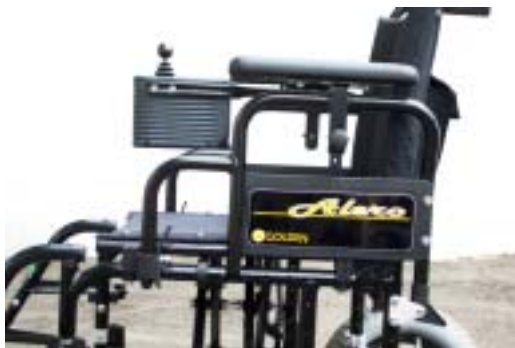
GP-50 full length armrest