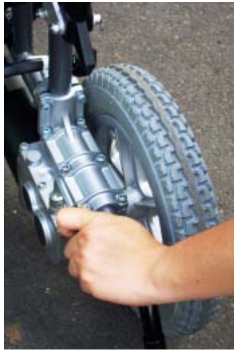
Fig 19 Drive engaged