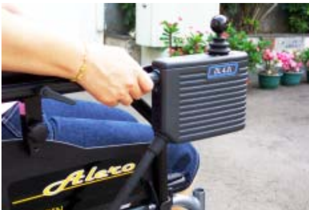
Fig 40 DL Joystick.