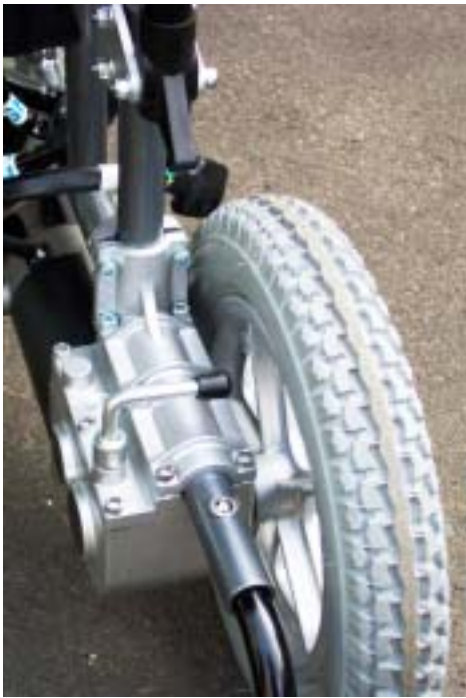
Fig 18 Drive Disengaged